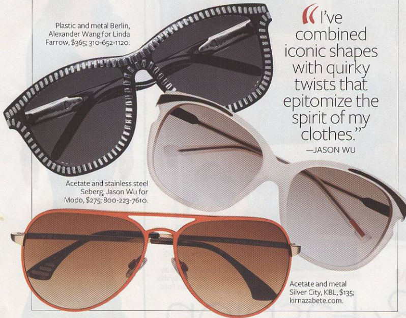
Plastic and metal Berlin, Alexander Wang for Linda Farrow, $365; 310-652-1120.