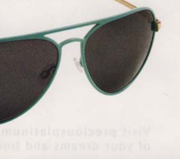
Jill Golden jewelry, Cushman handbag, and KBL sunglasses: Len Laqrus; Wildfox Couture: Emir Erap; Little House of Accessories: Caleb Lin; Cole and Amurri: Theo Wargo/WireImage; remaining images: courtesy of the designers and publisher